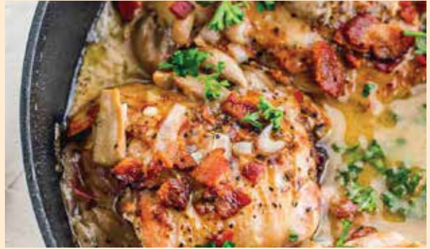
Smothered Stingin' Chicken

Served with sauteed onions, mushrooms, roasted red peppers, bacon, Cheddar and Mozzarella cheese and topped with a stingin' honey glaze over rice pilaf...25.99