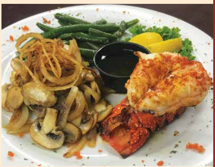
Surf & Turf