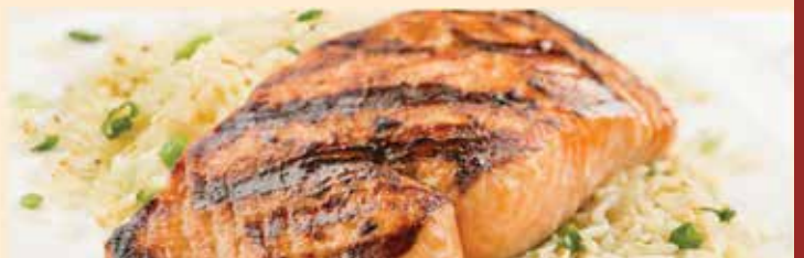
Korean Barbecued Salmon