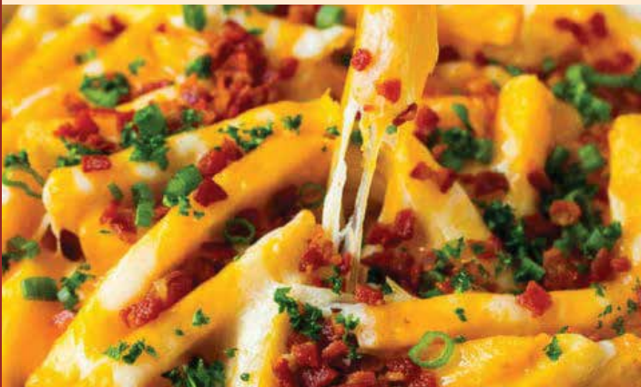
Ultimate Cheese Fries