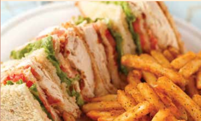
Turkey Club Sandwich

Triple decker sandwich with corned beef topped with sauerkraut, Thousand Island dressing and premium Swiss cheese on Rye bread...15.99