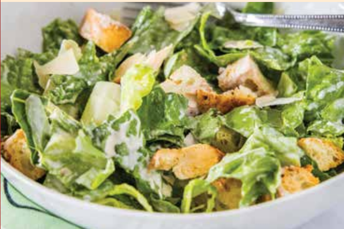
Chicken Caesar Salad

Fresh hand-dipped chicken tenders over fresh baby greens with cherry tomatoes, red onions, pepperoncinis, Mozzarella, Cheddar and bacon crumbles...16.99