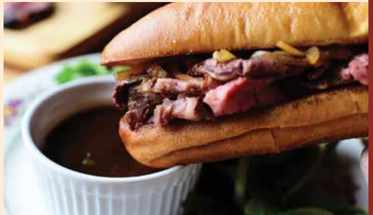
Sliced Steak Sandwich